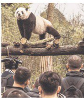
Bao Bao Wows in China Bao Bao, born in the National Zoo in Washington, came out of quarantine at her new home in Sichuan Province. Page A6.

By YIM ARUNGO and HELENE COOPER BAGHDAD — The American military continues in Iraq said Friday that it was investigating reports that scores of civilians — possibly as many as 200, credible sources said — had been killed in recent American airstrikes in Mosul, the northern Iraqi city at the center of an offensive to drive out the Islamic State. If confirmed, the series of airstrikes would rank among the highest civilian death tolls in an American air mission since the United States went to war in Iraq in 2003. And the reports of civilian deaths in Mosul come in starkly at odds with two recent episodes in Syria, where the coalition is also battling the Islamic State from the air, in which activists and local residents said dozens of civilians had been killed. Taken together, the surge of reported civilian deaths raised questions about whether onerous rules of engagement exist to minimize civilian casualties were being relaxed under the "Continued on Page A9"