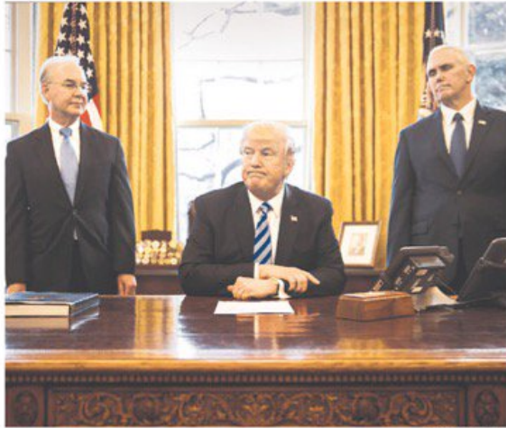
President Trump spoke Friday after the health bill was withdrawn and predicted the current health care program would not last.